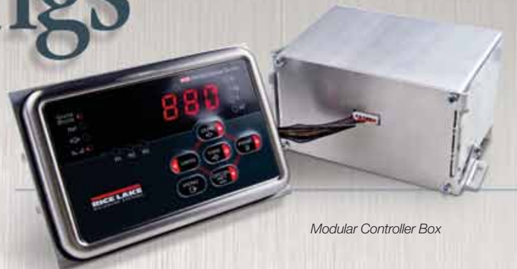
Modular Controller Box

The sleek design of the 880 not only looks great, it also fits great into existing and new panels alike. At just over four inches deep, the efficiently designed enclosure fits easily into compact spaces with built-in DIN-rail clips and pre-drilled holes to make mounting quick and effortless. The 880's modular design enables the display to be mounted up to 250 feet from the controller, useful for instances when it is inconvenient to mount the controller on a conventional panel. And communicating to a PLC independently of a display lends the 880 even greater versatility. The IP69K-rated gasket effectively resists high-pressure washdown and dust, keeping internal components out of harm's way in certain NEMA-required environments. Finally, the enhanced circuit protection is rated for industrial immunity and susceptibility from ESD/RFI/EMI, effectively filtering interference to provide stable weight values.